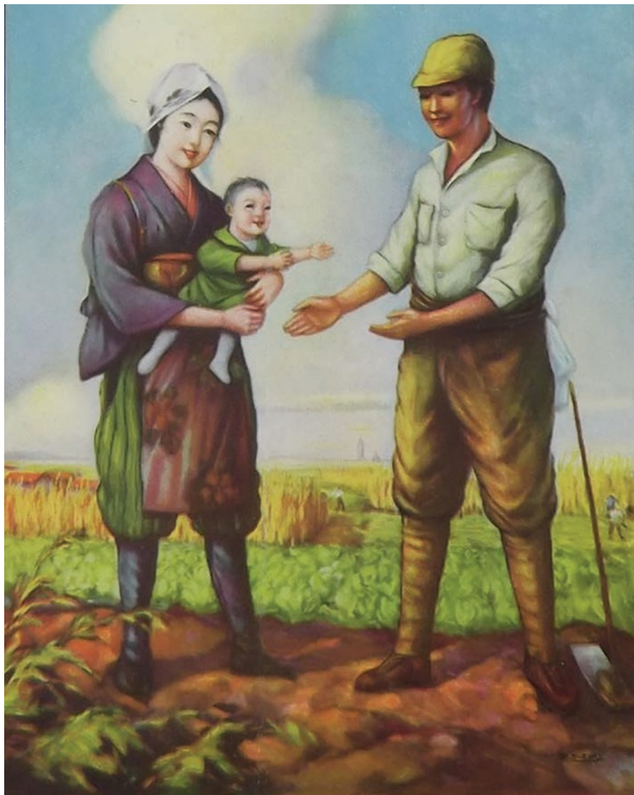
A poster published by the Japanese government in 1936 to celebrate the fifth anniversary of the Mukden Incident. It shows Japanese settlers in Manchukuo.

The Japanese aggression in Manchuria violated the Covenant of the League. The authority of the League in dealing with major Powers was tested. It failed utterly in dealing with this gross breach of the Covenant. The Council attempted to apply peaceful methods but when these failed it did not use force. The commercial and political interests of the major Powers in the Council, together with the likely military consequences, led them to withhold from the League the power necessary to force effective action. The smaller Powers in the Assembly wanted to apply economic sanctions through a world-wide boycott of Japan but they discovered that the major European Powers would not follow. This failure could not be blamed on lack of American cooperation because it consistently supported the League throughout.